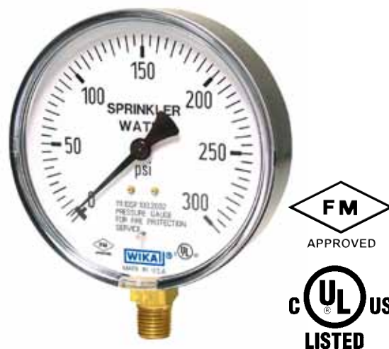
Bourdon Tube Pressure Gauge Type 111.10SP